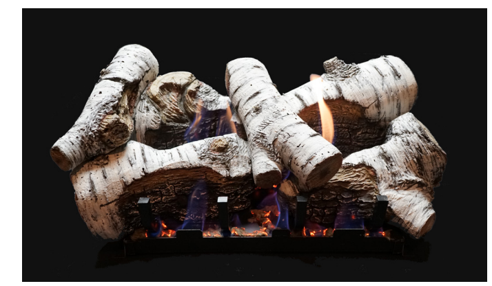
Birch Burncrete® Log Set (LS-18B2) with Vent-Free Slope Glaze Burner System (VFSR-18)