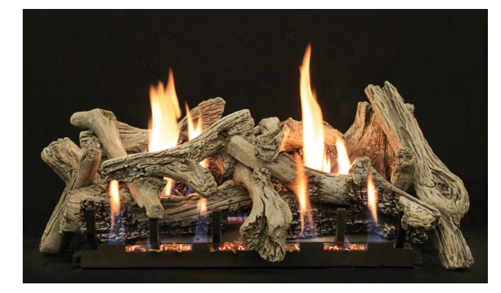
Driftwood Burncrete® Log Set (LS-24CD) with Vent-Free Slope Glaze Burner System (VFSR-24)