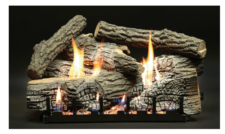
Super Stacked Wildwood Refractory Log Set (LS24WRS) with Vent-Free Slope Glaze Burner System (VFSR-24)

Stacked Wildwood Refractory Log Set (LS24WRR) with Vent-Free Slope Glaze Burner System (VFSR-24)