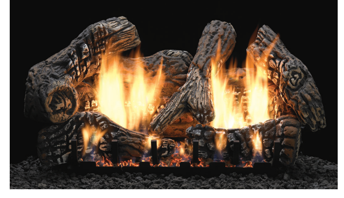
Super Charred Oak Ceramic Fiber Log Set (LS-24C2S) with Vent-Free Slope Glaze Burner System (VFSR-24)