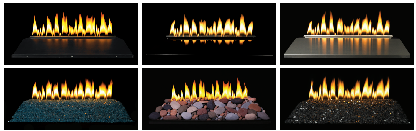
Top Row left to right: No Decorative Options, Polished Black Decorative Top, Brushed Stainless Steel Decorative Top. Bottom Row left to right: Blue Clear Decorative Glass, Medium Decorative Rocks and Accent Pebbles, Polished Black Decorative Glass. (Clear Frost Decorative Glass shown on opposite page)