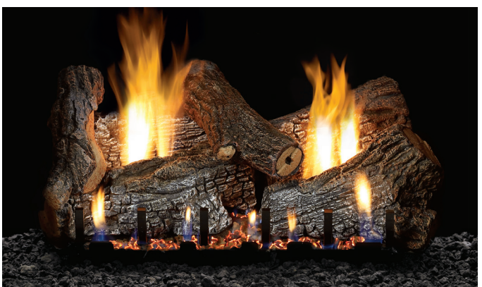
Super Sassafras Refractory Log Set (LS-24RSS) with Vent-Free Slope Glaze Burner System (VFSR-24)