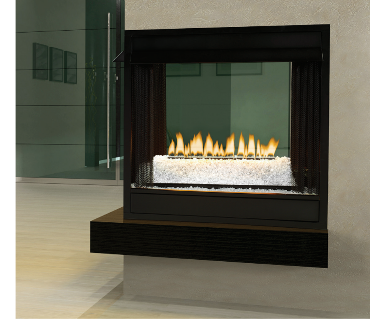
Loft Series Vent-Free Multi-sided burner (VFRU-24) with Clear Frost Decorative Glass (DG-30-CLF). Shown in a Vent-Free peninsula firebox with Flush Louvers.