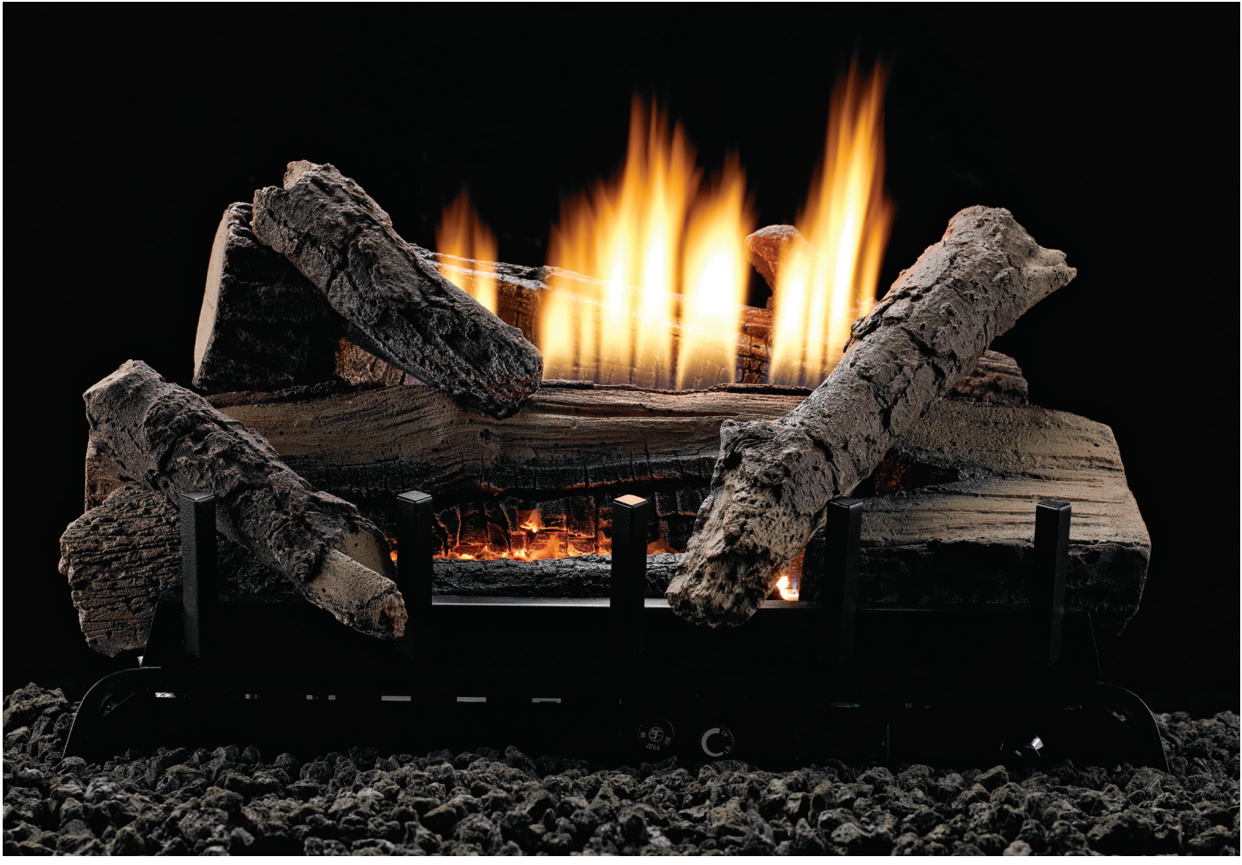
Whiskey River Refractory Log Set and Vent-Free Burner Combination (VFDR-18-LBW)

The Flint Hill and Whiskey River are also offered in 10,000 Btu models for bedroom applications, where allowed by code.