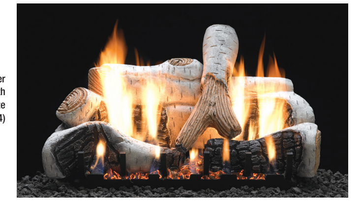
Birch Ceramic Fiber Log Set (LS-24B2) with Vent-Free Slope Glaze Burner System (VFSR-24)