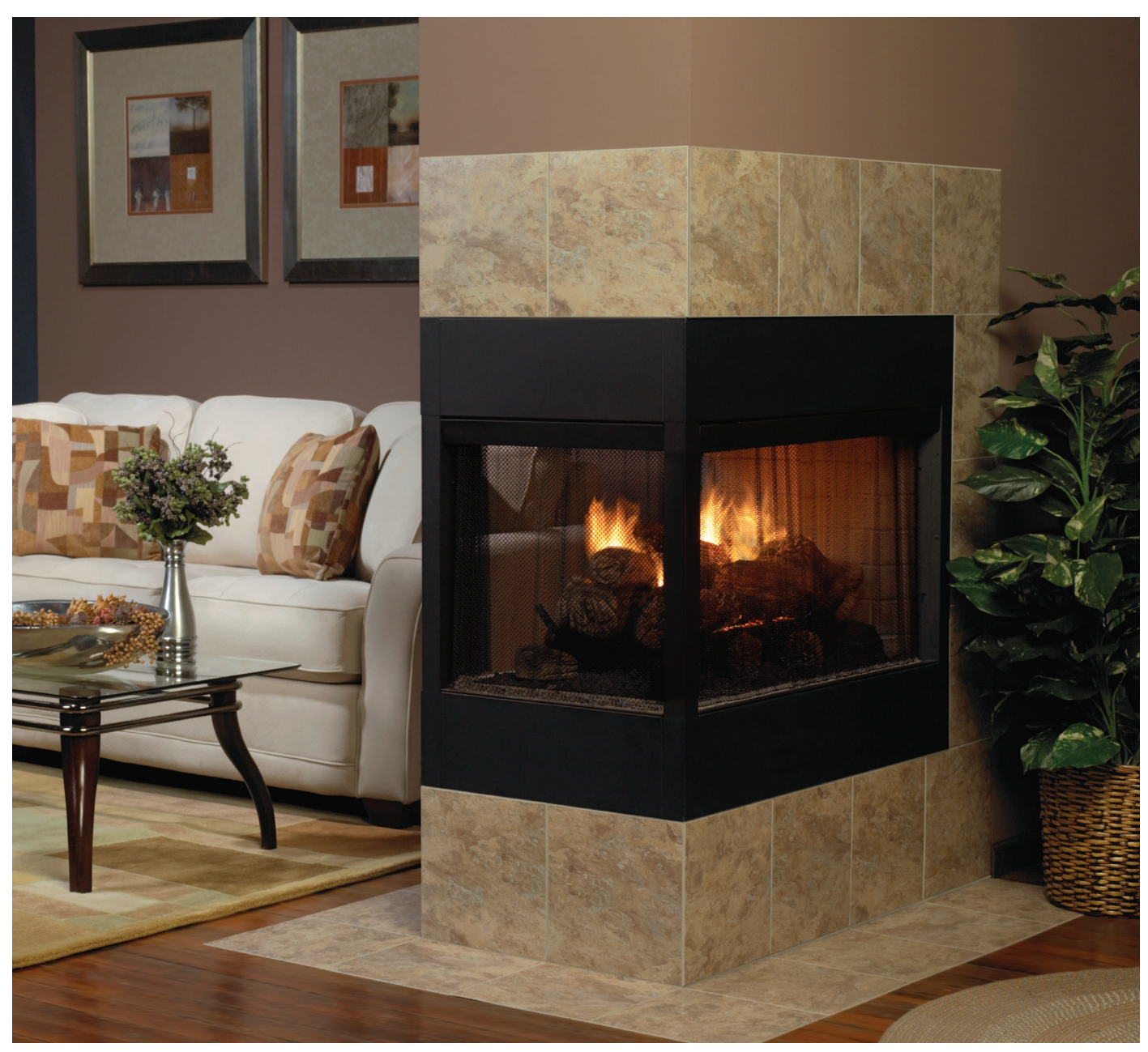
White Mountain Hearth Stone River Log Set (LSU-24SF) on a Vent-Free Slope Glaze Vista Burner. Shown in a peninsula firebox with custom tile surround. The optional Large Log Embers Kit (EK-2) and Platinum Glowing Embers (PE20) add that extra spark of realism.