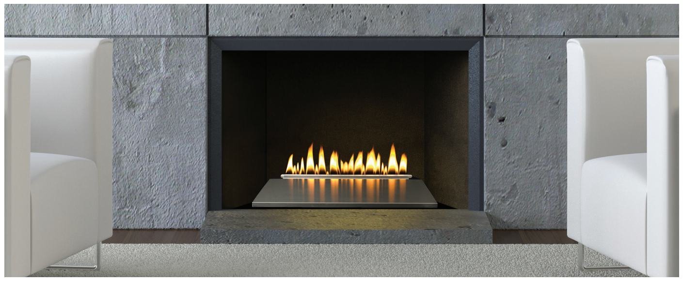
Loft Series Vent-Free Burner (VFRL-24) with Stainless Steel Decorative Top (DT-24-SS). Shown in existing masonry firebox.

A vent-free Millivolt Loft Burner may also be installed as a decorative appliance in a vented fireplace to provide ambiance and light – but without the heat. In a vented installation, the burner cannot be operated by thermostat, and the flue damper must be blocked open. A damper clamp is included with all Loft burners. Because IP Loft Burners include a thermostat remote and may not be installed as decorative appliances, a non-thermostat remote is available.