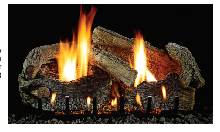
Stacked Aged Oak Refractory Log Set (LS-24SRAO) with Vent-Free Slope Glaze Burner System (VFSR-24)