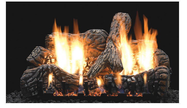
Charred Oak Ceramic Fiber Log Set (LS-24C2) with Vent-Free Slope Glaze Burner System (VFSR-24)