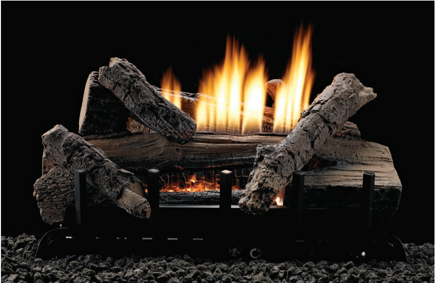
Concord Refractory Log Set and Vent-Free Burner combination (VFDR-18-LBW)

The Trenton and Concord are also offered in 10,000 Btu models for bedroom applications, where allowed by code.