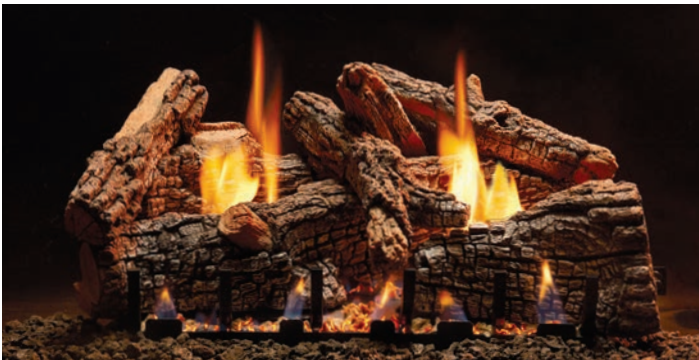
Ravenwood Refractory Log Set (ALS-24RV) with Vent-Free Slope Glaze Burner System (VFSE-24)