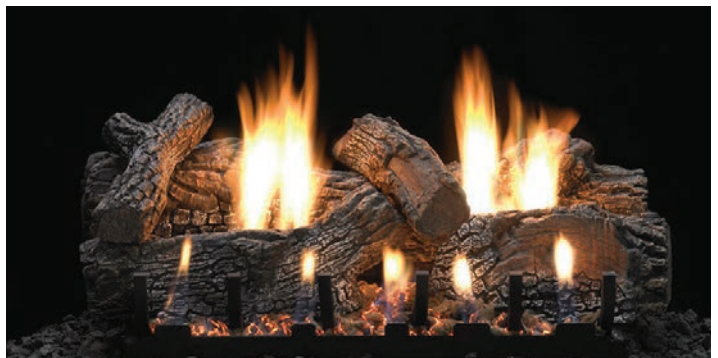
Charleston Refractory Log Set (ALS-24CRI) with Vent-Free Slope Glaze Burner System (VFSR-24)