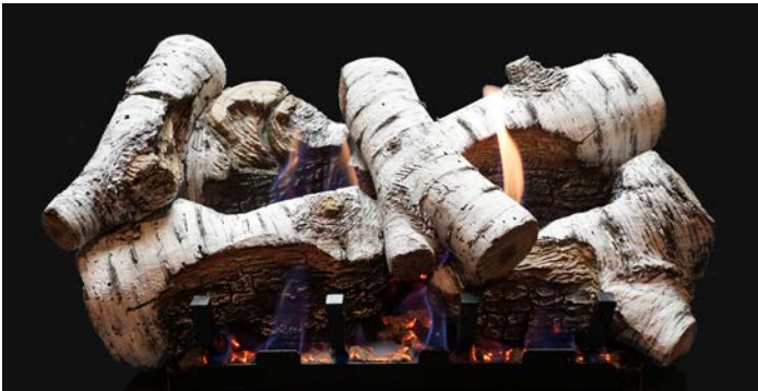
Birch Burncrete® Log Set (LS-18CB) with Vent-Free Slope Glaze Burner System (VFSR-18)