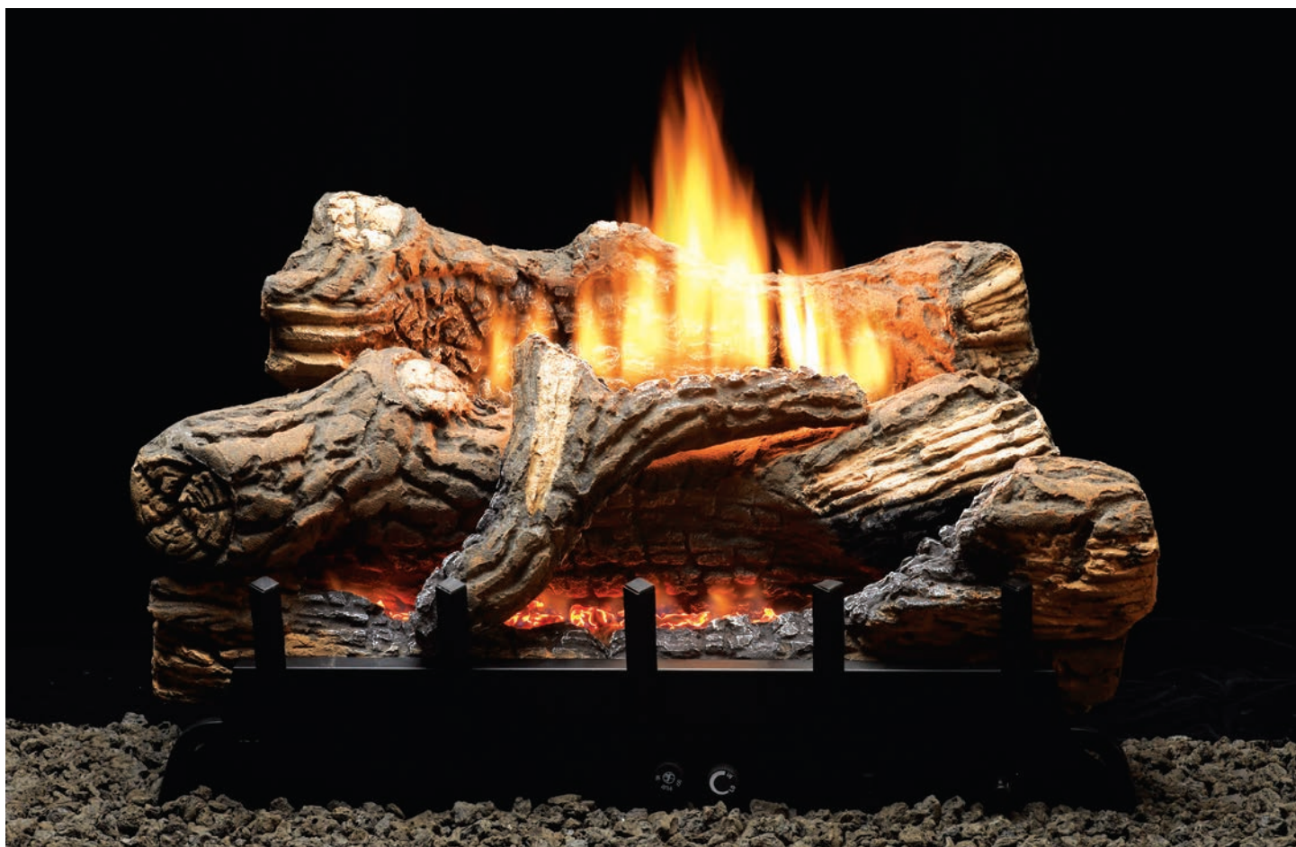
Trenton Ceramic Fiber Log Set and Vent-Free Burner Combination (VFDR-24LB)

The Trenton Log Set features richly detailed, hand-painted Ceramic Fiber logs mounted atop our Vent-Free Contour Burner. This complete set includes glowing embers to add to the illusion of a real wood fire at any heat setting. This competitively priced set is ideal for existing fireplaces and fireboxes and for new construction. Available in manual control, thermostat control, or remote-ready Millivolt – in 28,000 Btu, 34,000 Btu and 40,000 Btu.