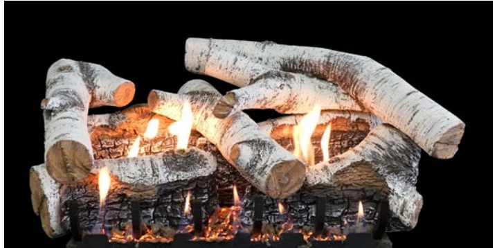
Super Birch Burncrete® Log Set (LS-24CBS) with Vent-Free Slope Glaze Burner System (VFSR-24)