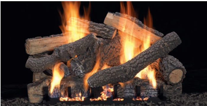
Williamsburg Refractory Log Set (ALS-24CR2) with Vent-Free Slope Glaze Burner System (VFSR-24)