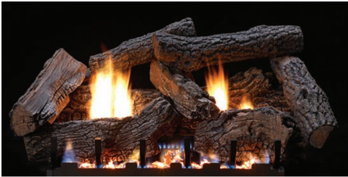
Charleston Select Refractory Log Set (ALS-24CRIS) with Vent-Free Slope Glaze Burner System (VFSR-24)