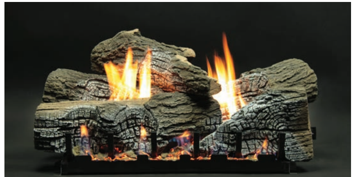
Stacked Wildwood Refractory Log Set (LS24WRR) with Vent-Free Slope Glaze Burner System (VFSR-24)