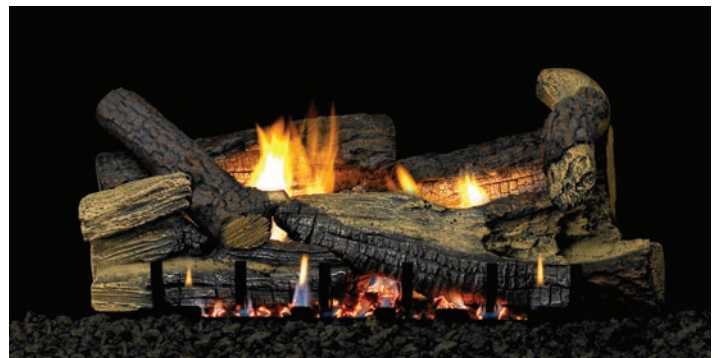
Refractory Yorktown Log Set (ALS-24YK) with Vent-Free Slope Glaze Burner System (VFSE-24)