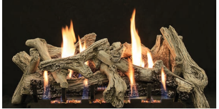
Driftwood Burncrete® Log Set (LS-24CD) with Vent-Free Slope Glaze Burner System (VFSR-24)