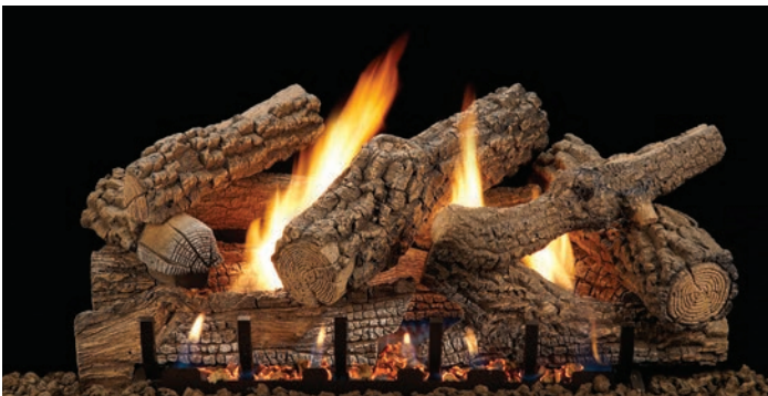
Saratoga Refractory Log Set (ALS-24SG) with Vent-Free Slope Glaze Burner System (VFSR-24)