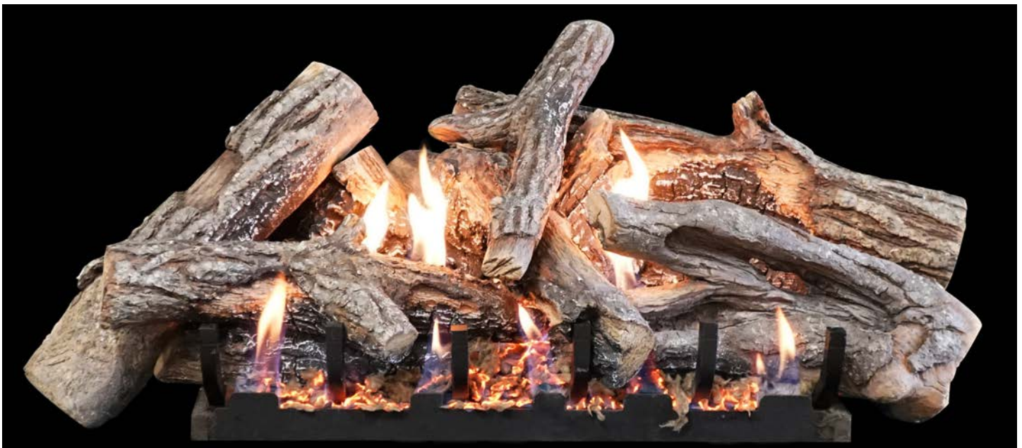
Fallen Timber Log Set (LS-24CT) with Vent-Free Slope Glaze Burner System (VFSR-24)