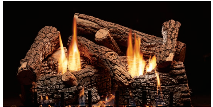
Ravenwood Select Refractory Log Set (ALS-24RVS) with Vent-Free Slope Glaze Burner System (VFSE-24)