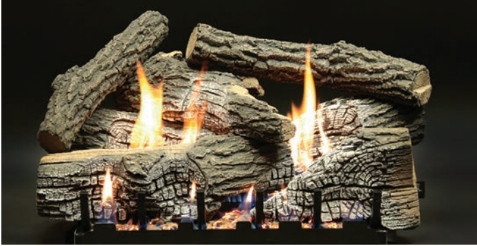
Super Stacked Wildwood Refractory Log Set (LS24WRS) with Vent-Free Slope Glaze Burner System (VFSR-24)