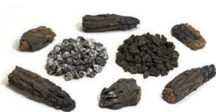
EK-1 Traditional Ember Bed Kit includes six burnt log pieces, white ash, and lava rock.