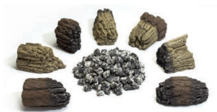
EK-2 Large Ember Kit available for Multi-sided log sets or large fireplaces.