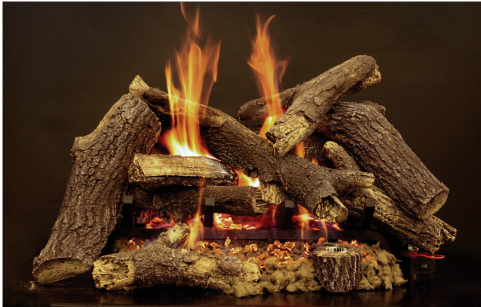
Pioneer Refractory Vented Log Set on 24-inch Elite Radiant Vented Burner

An Elite Radiant Vented Burner is not complete without a hand-painted log set to accompany it. Two compatible log sets, the Pioneer Refractory Vented Log Set and the Kensington Forest Ceramic Fiber Vented Log Set, fit perfectly with the Elite Radiant Vented Burners. Both log sets combine large logs and smaller branches with intricate hand painted details. The Pioneer Refractory Vented Log Set uses reinforced refractory construction for maximum durability. The lightweight Kensington Forest Ceramic Fiber Log Set presents a stunning fire and glow.