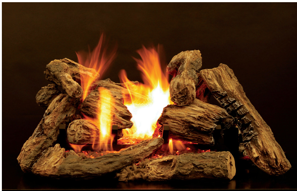
Kensington Forest Ceramic Fiber Vented Log Set on 24-inch Elite Radiant Vented Burner