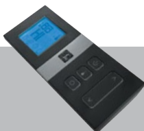
WALL REMOTE EC1550