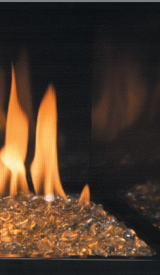
MONTIGO / ILLUME / 34FID / CONTEMPORARY