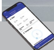
WIFI PHONE APP CONTROL SIT-WIFI