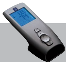
REMOTE ^ RXM5010