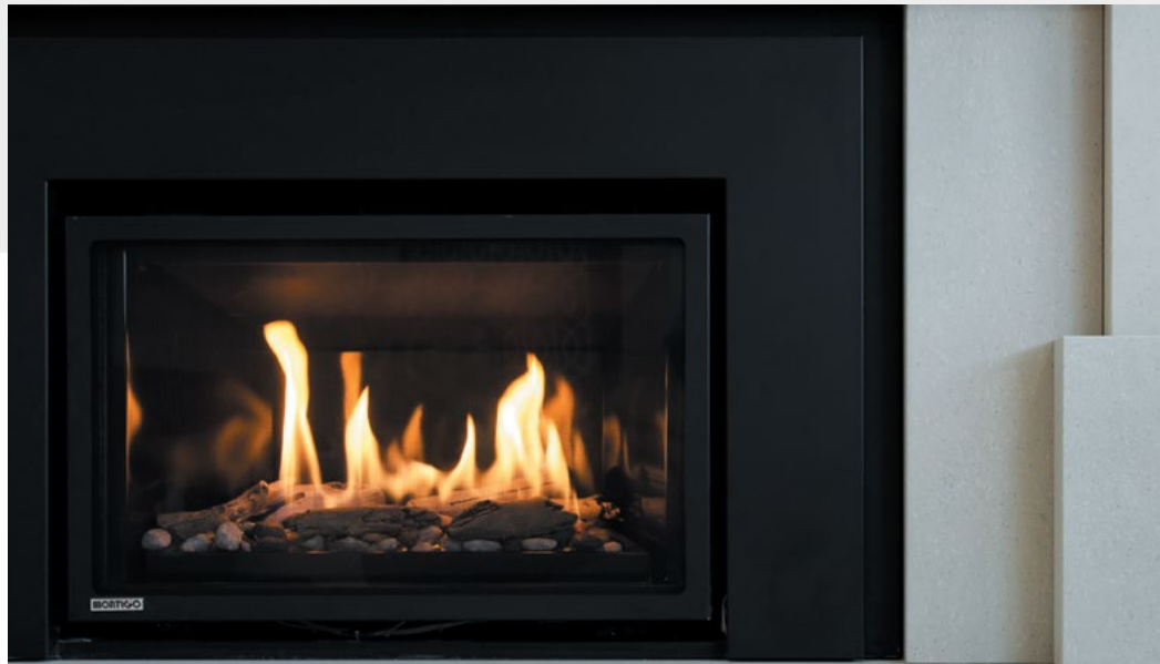
MONTIGO / ILLUME / 30FID / CONTEMPORARY