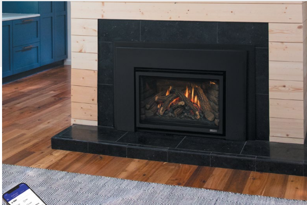
MONTIGO / ILLUME / 30FID / TRADITIONAL