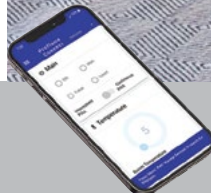
WiFi PHONE APP CONTROL SIT-WIFI