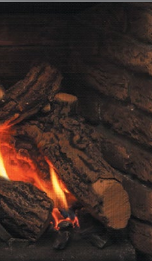
MONTIGO / ILLUME / 34FID / TRADITIONAL