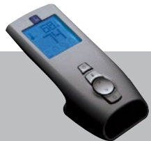
REMOTE A RXM5010